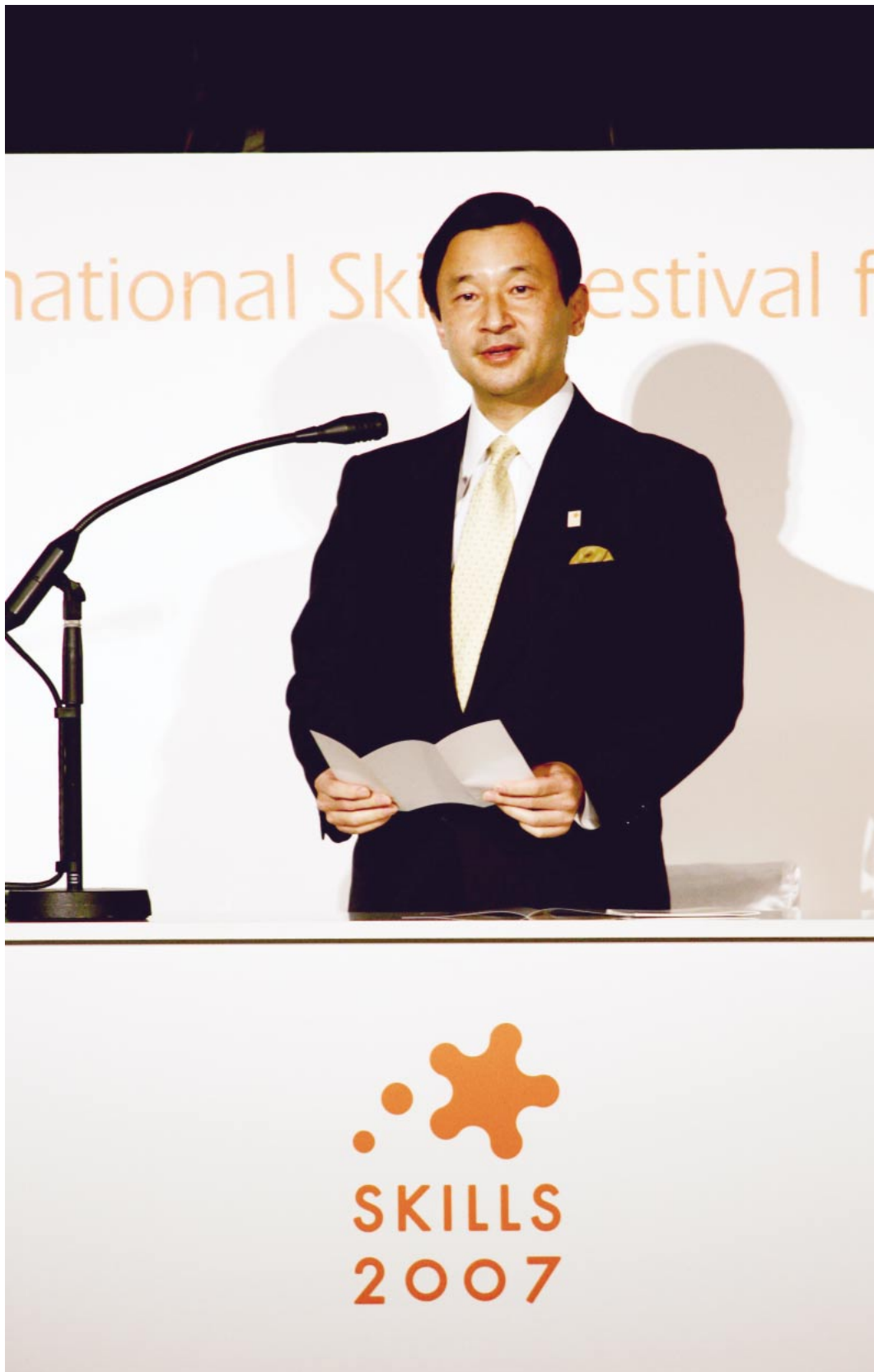
2007年ユニバーサル技能五輪国際大会名誉総裁皇太子殿下 His Imperial Highness The Crown Prince Honorary President International Skills Festival for All, Japan 2007