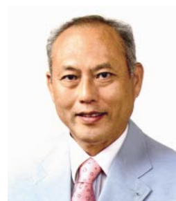
Yoichi Masuzoe Minister of Health, Labor and Welfare