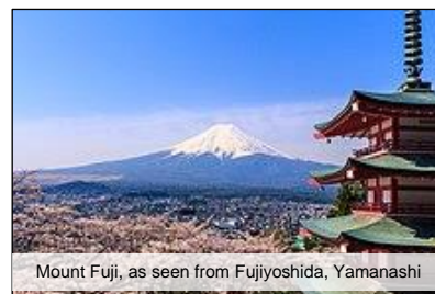
Mount Fuji, as seen from Fujiyoshida, Yamanashi

The 2017 Travel and Tourism Competitiveness Report ranked Japan 4th out of 141 countries overall, which was the highest in Asia. Japan gained relatively high scores in almost all of the featured aspects, such as health and hygiene, safety and security, cultural resources and business travel. In the 2021 edition of the report, now called Travel and Tourism Development Index, Japan reached the 1st place.