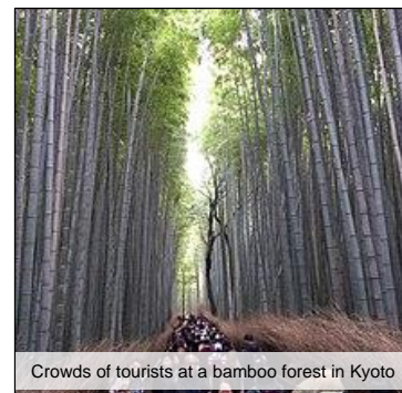
Crowds of tourists at a bamboo forest in Kyoto