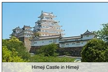
Himeji Castle in Himeji

Following the Meiji Restoration and the building of a national railroad network, tourism became more of an affordable prospect for domestic citizens and visitors from foreign countries could enter Japan legally. As early as 1887, government officials recognized the need for an organized system of attracting foreign tourists; the Kihinkai (貴賓会), which aimed to coordinate the players in tourism, was established that year with Prime Minister Itō Hirobumi's blessing.